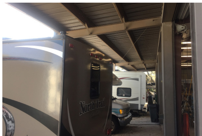
Overhang of exterior service building