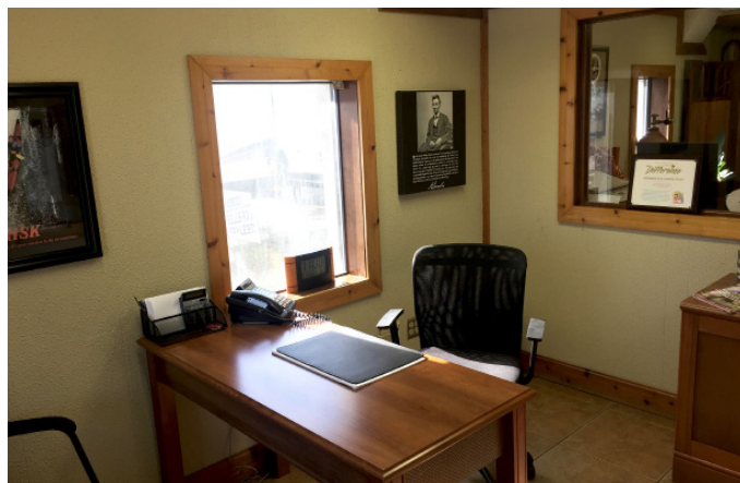
Downstairs - office 3