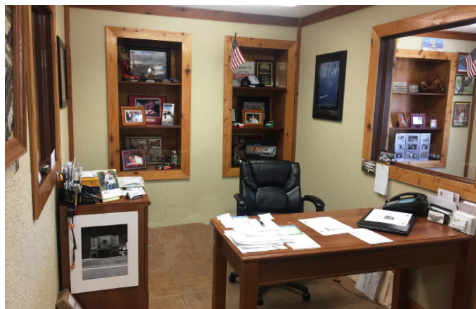
Downstairs - office 1