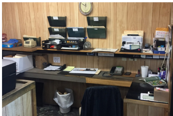
Office area inside service building area