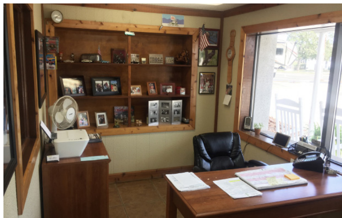
Downstairs - office 2