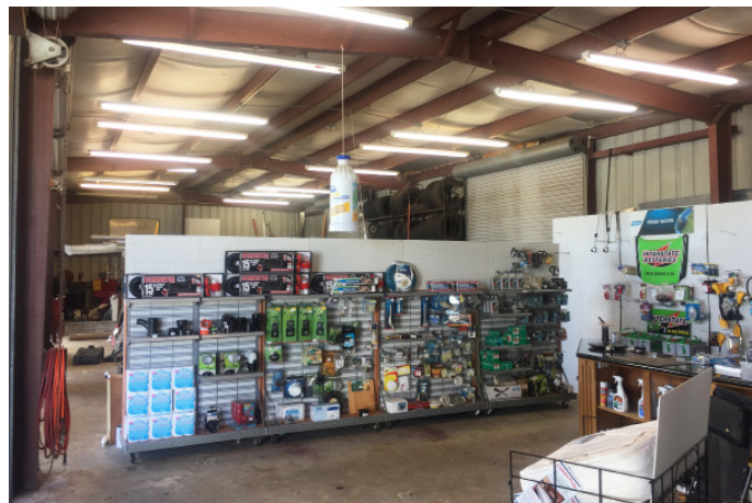
Interior of service building