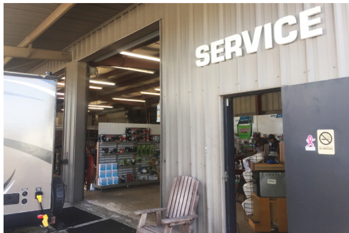
Service building entrance

Building size: 3,610 SF - Features five grade level doors in front of the building and 2 grade level doors in rear