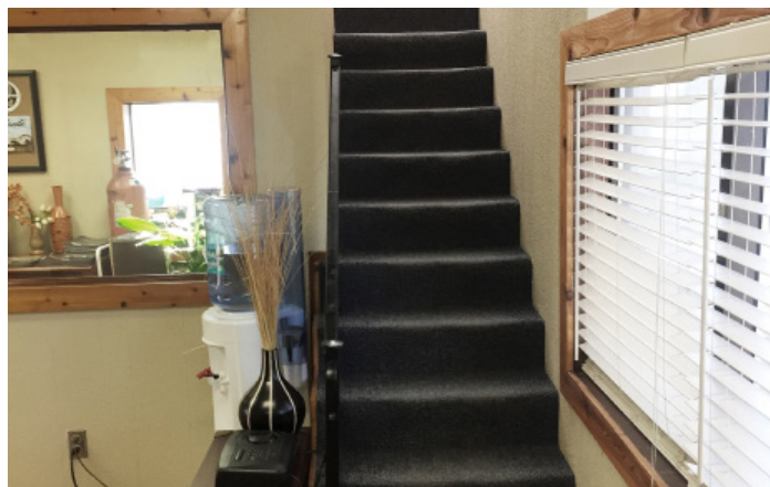
Stairway to second story