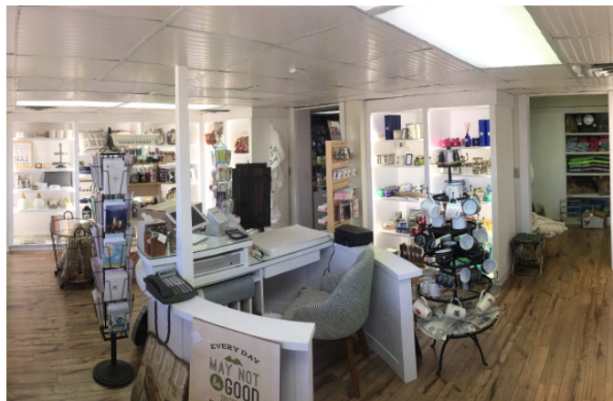
Gift shop area