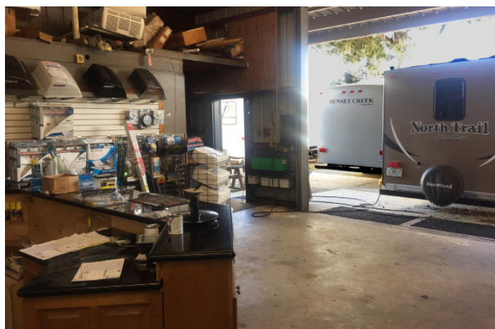
Interior of service building