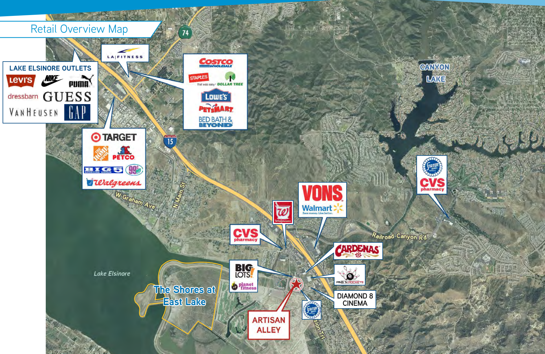
Retail Overview Map

DIAMOND DRIVE & MALAGA ROAD, LAKE ELSINORE, CA