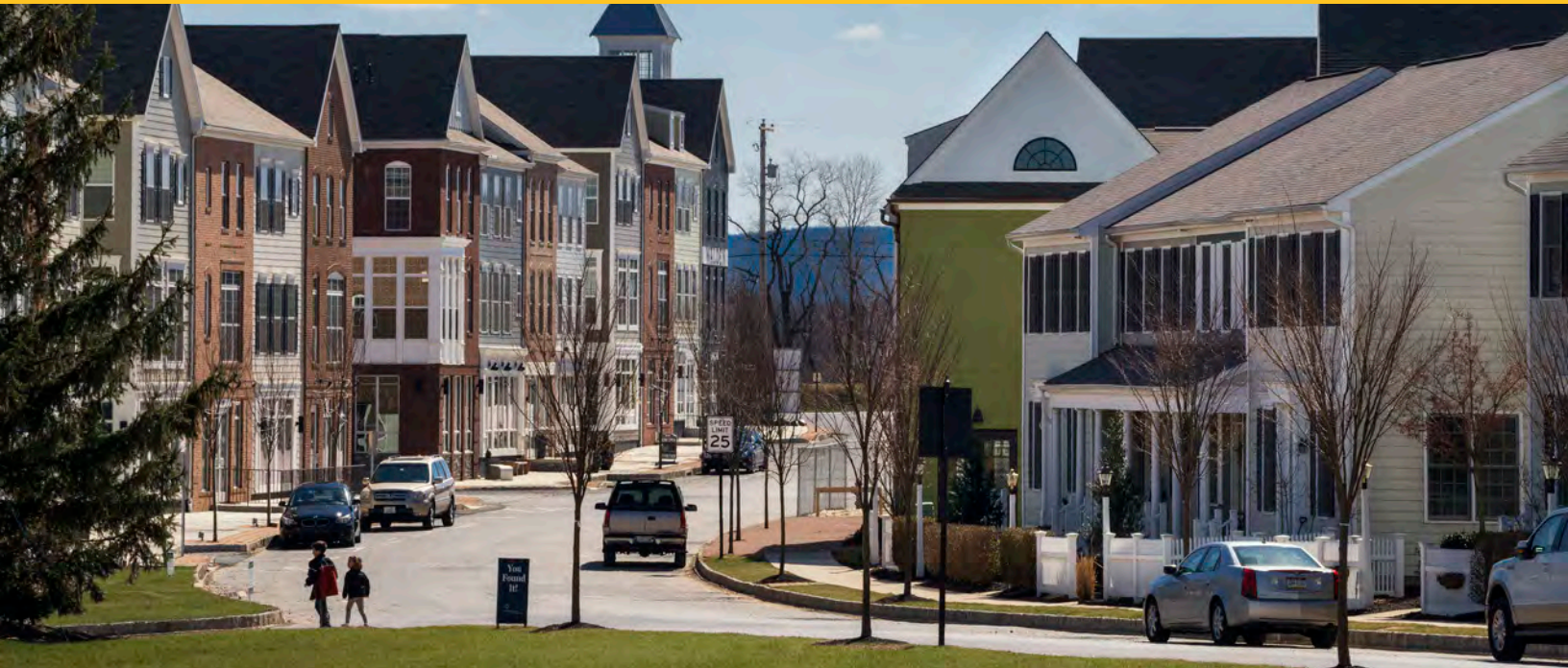
Photograph of actual neighborhood built by developer.

EXCITING NEW COMMERCIAL RETAIL, OFFICE & MULTIFAMILY DEVELOPMENT OPPORTUNITY