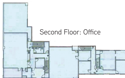
Second Floor: Office