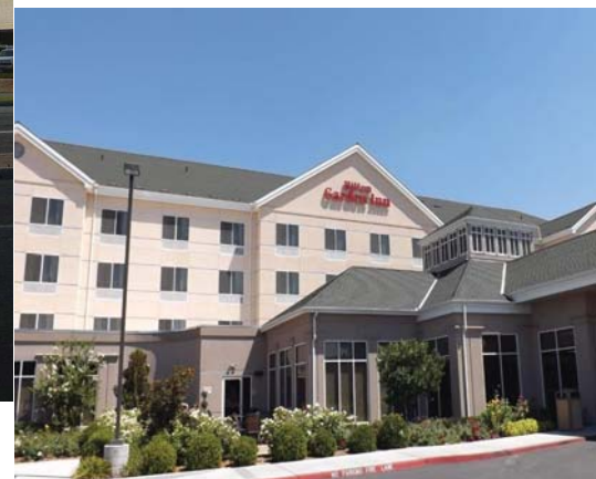
Near 3 Hotels