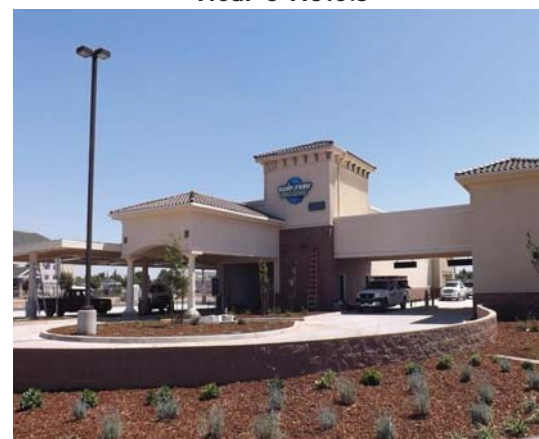
Surf Thru Car Wash Next Door