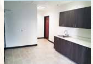
Common Area Breakroom/Restrooms