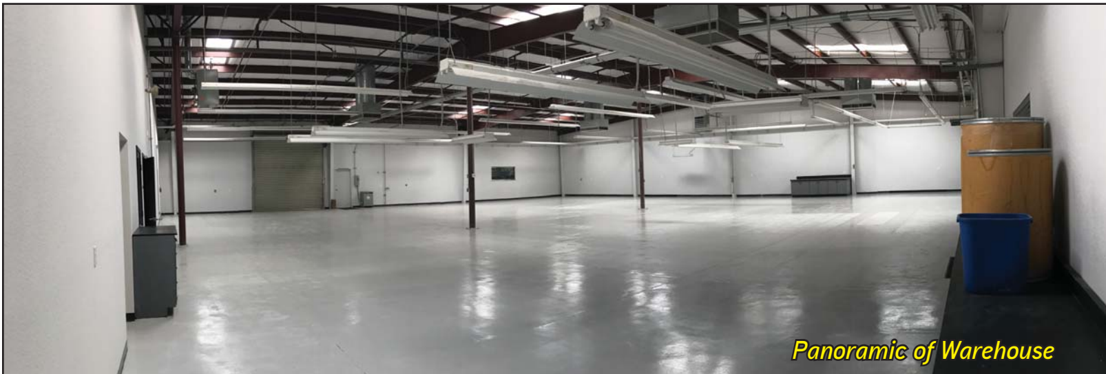
Panoramic of Warehouse

This property is located in one of Fresno's most desirable commercial areas; Woodward Industrial Park. All of the great amenities of River Park are within two minutes. On and off ramps to north/south bound Freeway 41 are less than two miles from the site, providing great access to South Fresno and north to Madera Ranchos. The building is in excellent condition, showing very little wear. It has a total available square footage of ±11,652 square feet which is comprised of ±4,032 square feet of drop ceiling office space, reception area, two large design/conference rooms, break rooms, three restrooms and ±7,620 square feet of climate controlled warehouse space which includes full skylights throughout, a separate entrance for will-call and a separate warehouse restroom. There is ample customer and employee parking in front, as well as plenty of additional spillover street parking. New owner has recently made extensive renovations including: adding an entrance, landscaping, repairing HVAC, LED lighting (offices), alarm system, paint in warehouse and ADA compliance. Tenant will be given allowance for carpet and paint in office space.