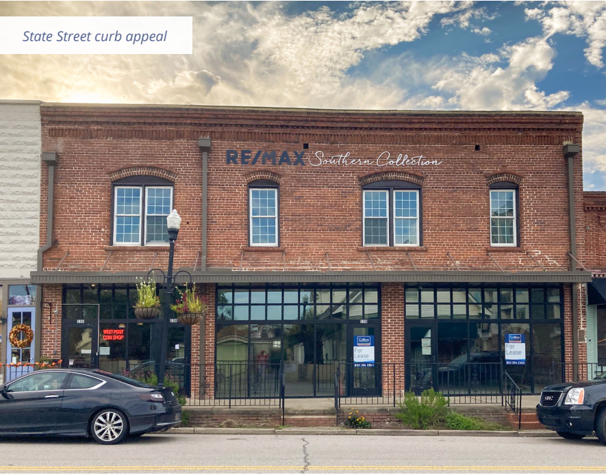
State Street curb appeal