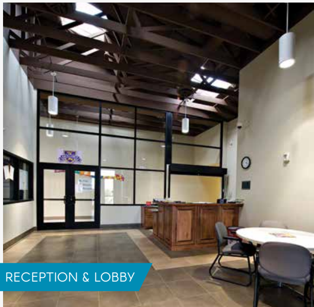
RECEPTION & LOBBY