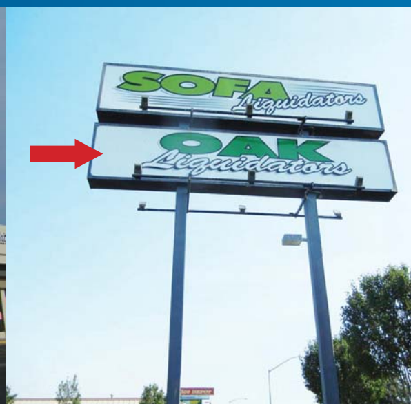
Pole Signage Available