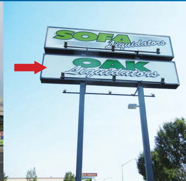
Pole Signage Available