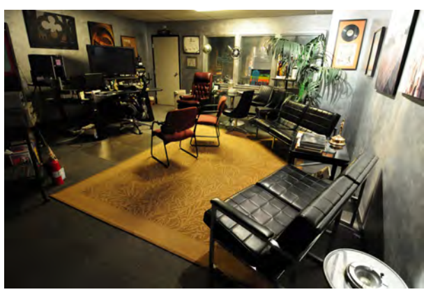
Edit Suite: Plenty of power for whatever you want to do. Built-in fluorescent and incandescent track lighting, also windows to view the stage and access to Studio B from the balcony. Second Edit Suite available with wet bar and view of Studio B.