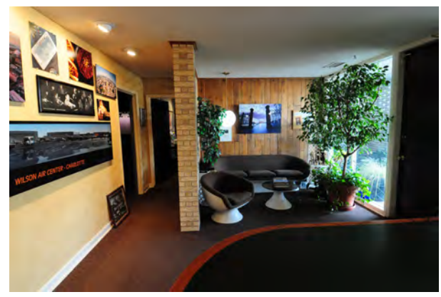
Reception: Waiting area and receptionist station.