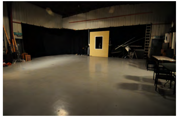
Studio A : 2,500 square feet total. 50 feet by 50 feet, 20 foot ceiling, 14 foot overhead door access, shooting balcony, completely equipped kitchen and over 100 amps of power.