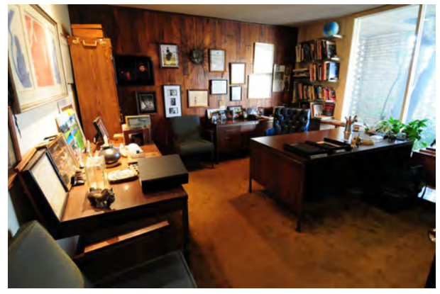
Front Office : Executive office has a wet bar, desk and credenza, with an array of dimmable lights.