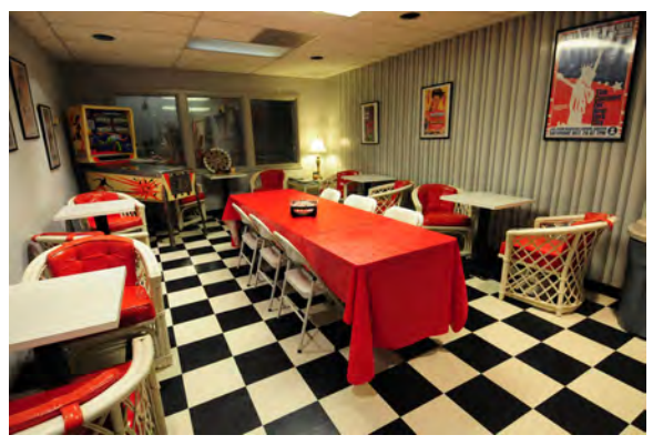
Breakroom/green room : Fully equipped with fridge, microwave, sink, phone service, array of cabinets.

AGENT: BEN RICKETTS 901 375 4800 | EXT 4909 MEMPHIS, TN ben.ricketts@colliers.com