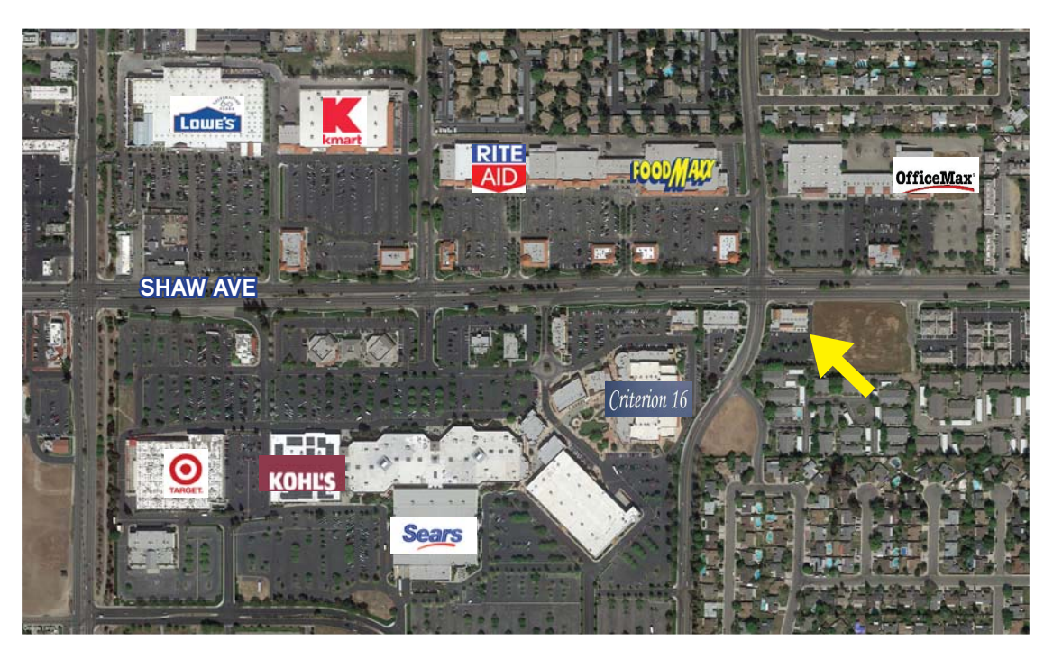
Suite 105: 3,264 RSF