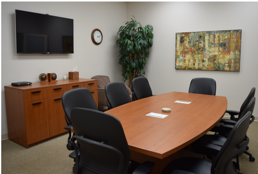
Shared conference room