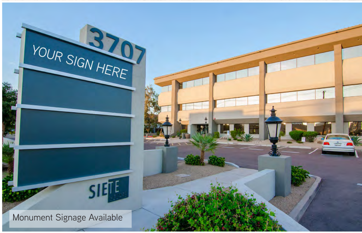
Monument Signage Available