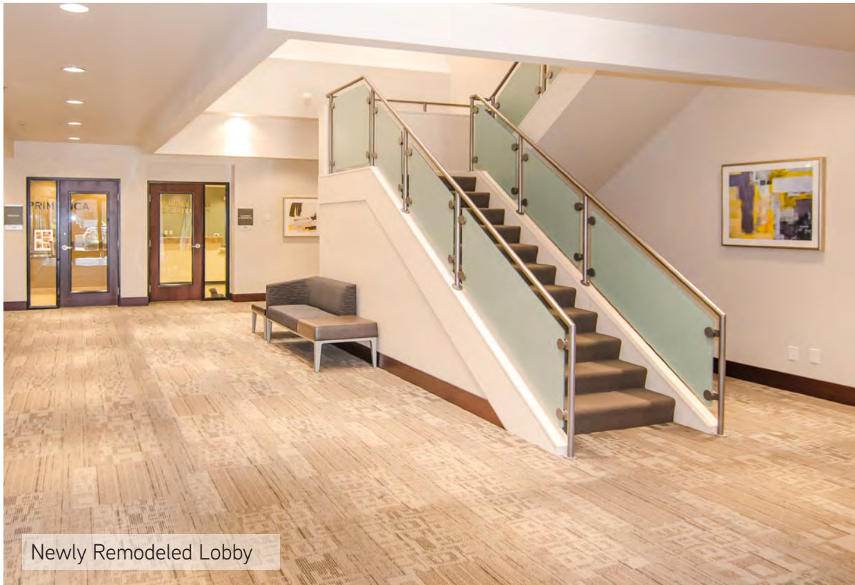
Newly Remodeled Lobby