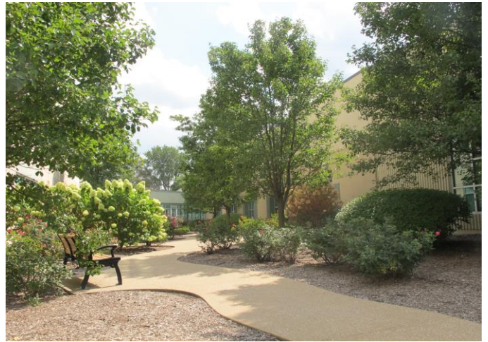
Exterior Seating / Lunch Area