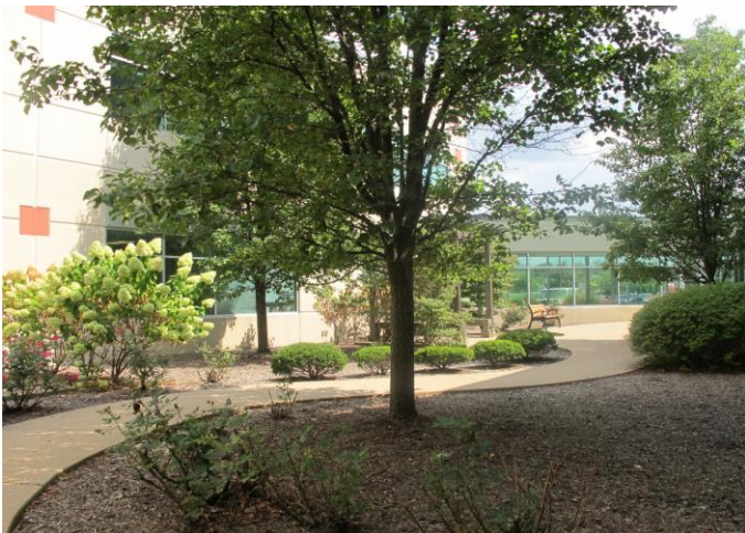
Exterior Seating / Lunch Area