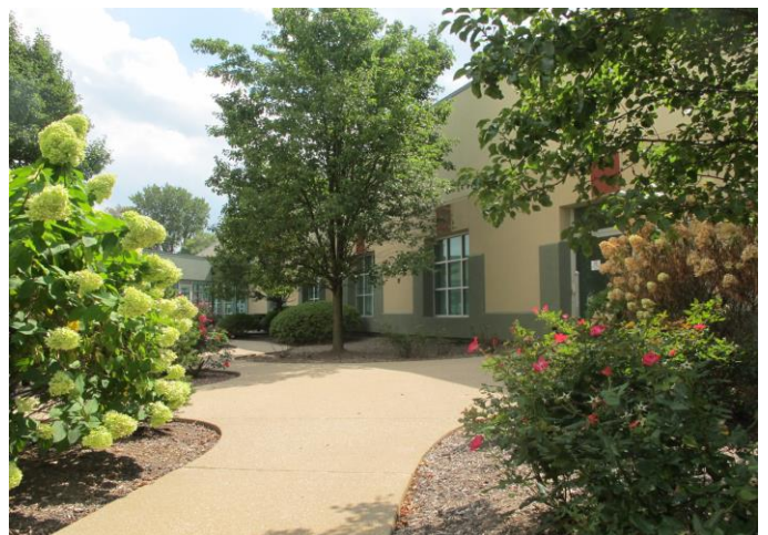
Exterior Seating / Lunch Area