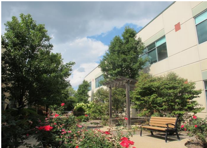
Exterior Seating / Lunch Area