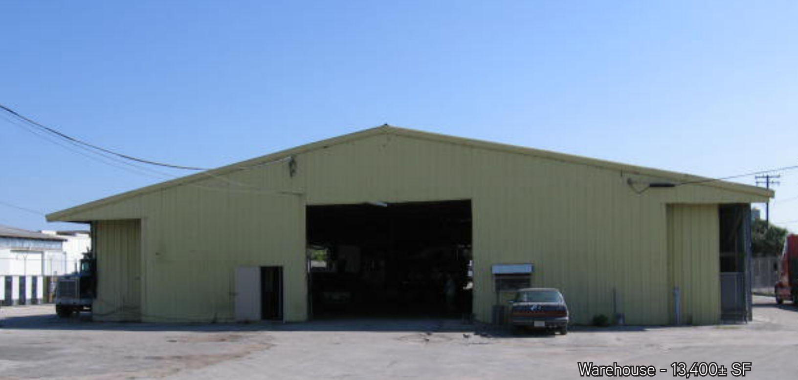
Warehouse - 13,400± SF