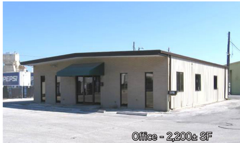
Office - 2,200± SF