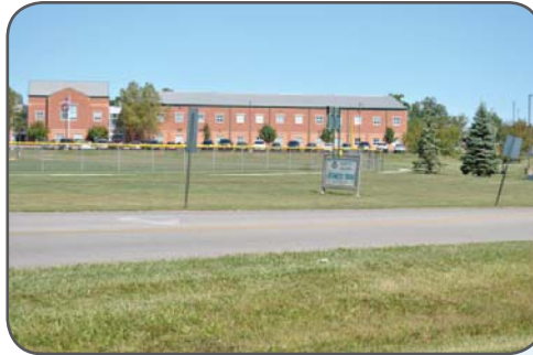
North Adams High School (7-12)