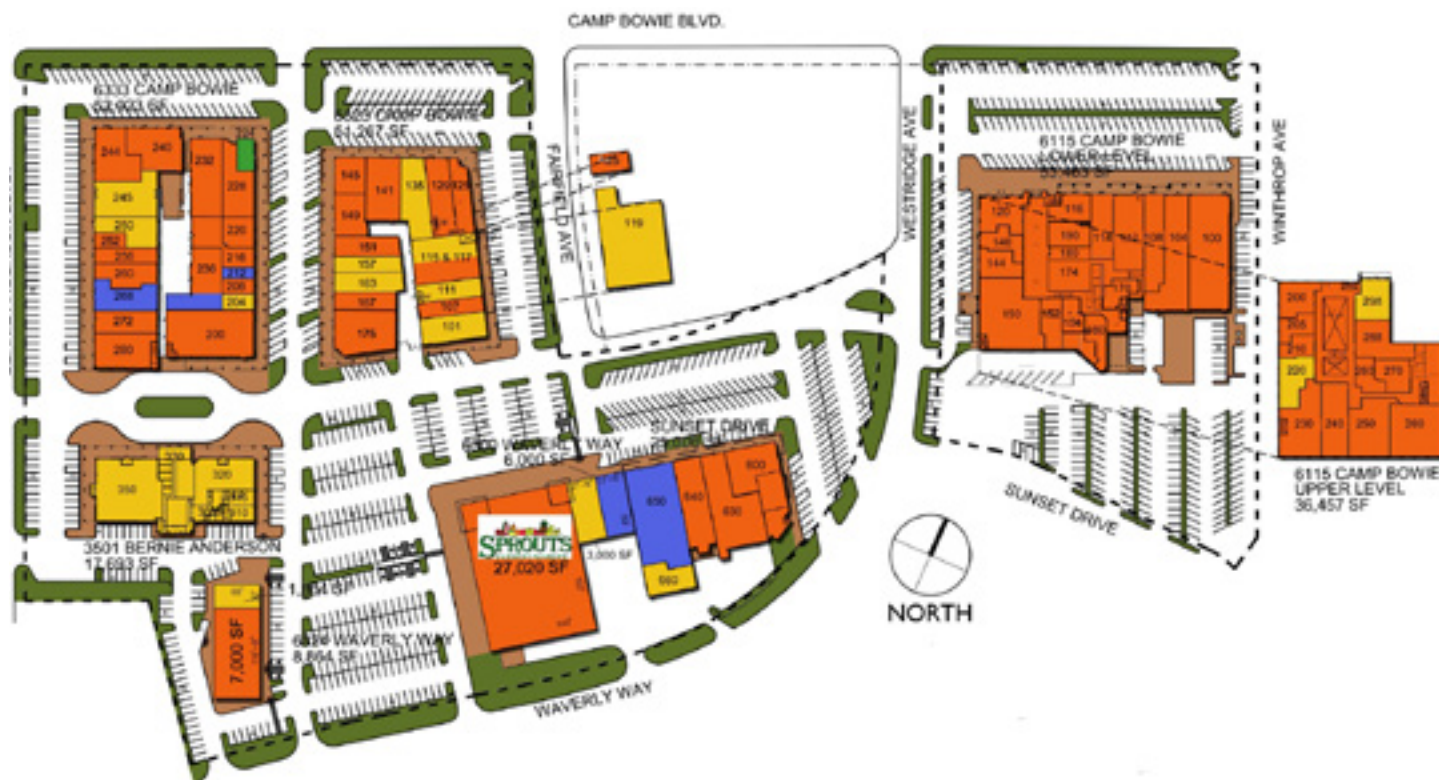
STE. 255 2,787 RSF

6115 CAMP BOWIE BLVD., FORT WORTH TX 76116