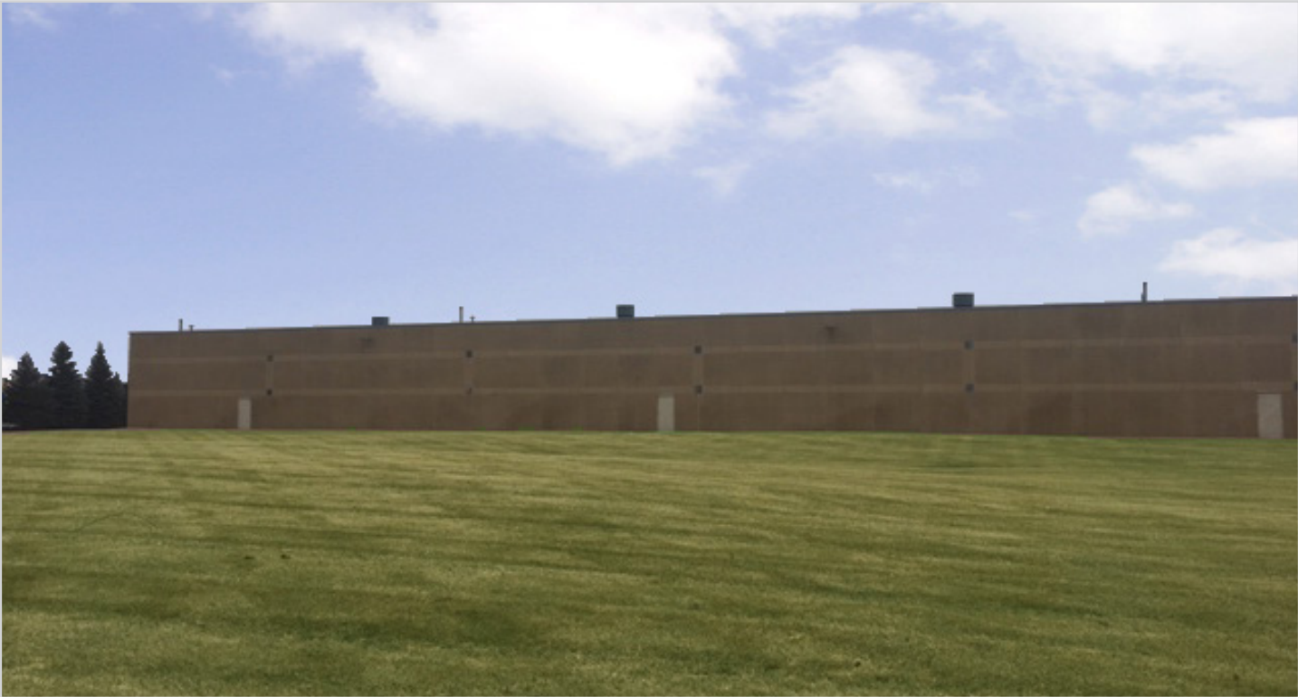
FENCED OUTSIDE STORAGE/TRAILER STORAGE AREA