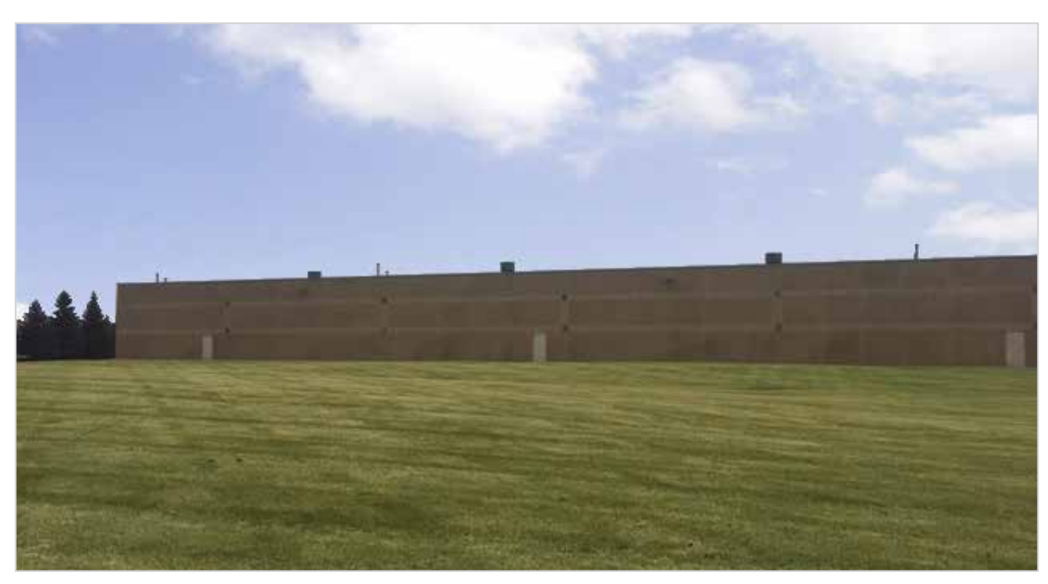
FENCED OUTSIDE STORAGE/TRAILER STORAGE AREA