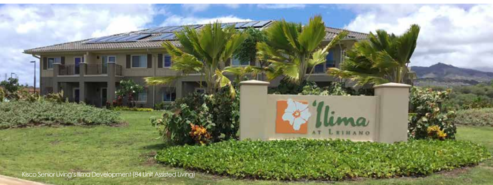
Kisco Senior Living's Ilima Development (84 Unit Assisted Living)