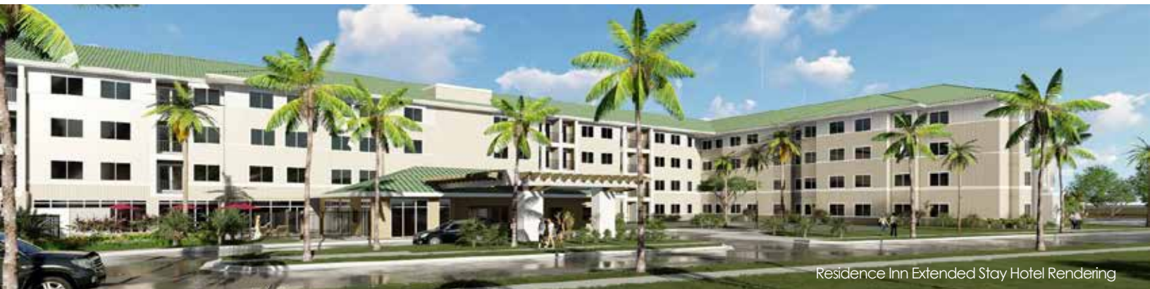
Residence Inn Extended Stay Hotel Rendering