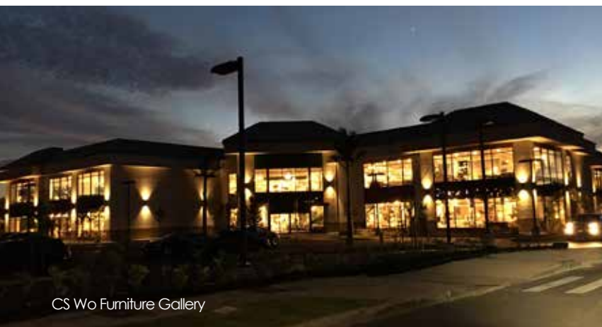
CS Wo Furniture Gallery