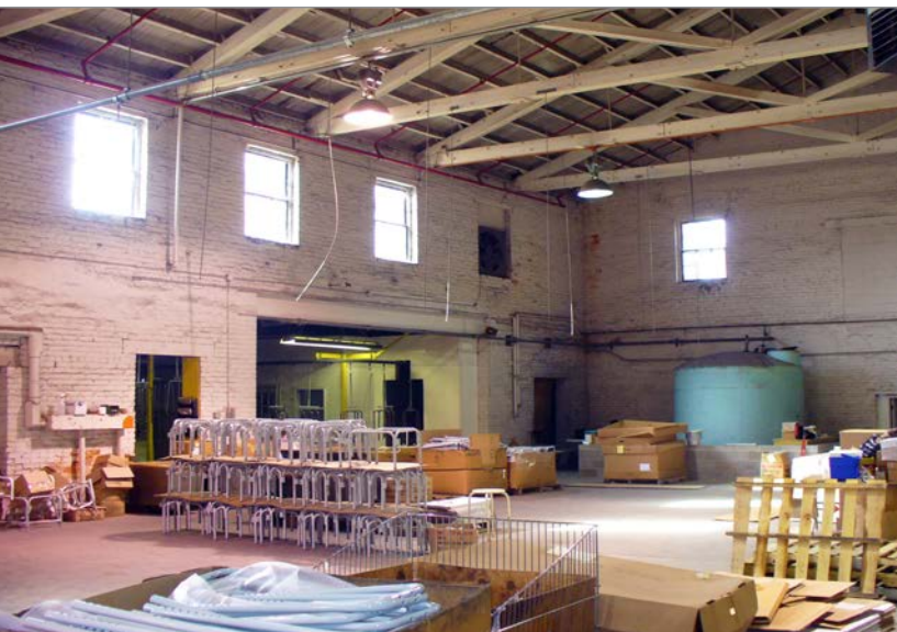
Potential for mezzanine style lofts or clubhouse