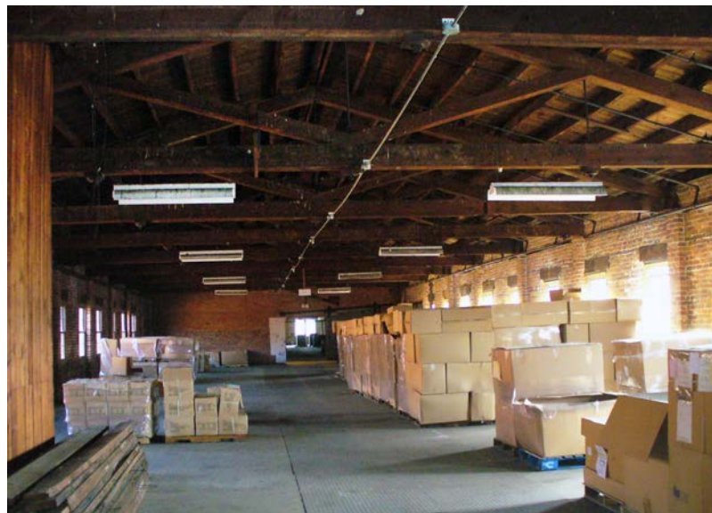
Notice the abundance of existing windows and day light