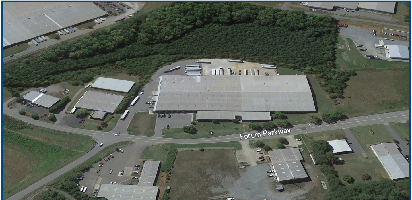
Property Road View