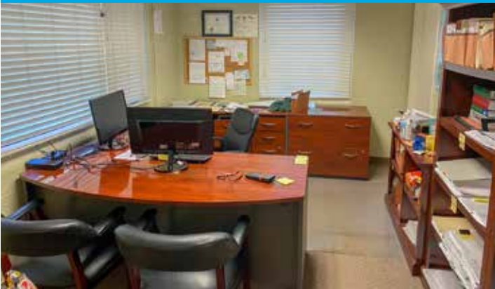
Building 1 - Office