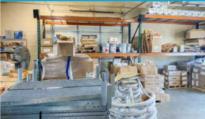
Building 1 - Warehouse