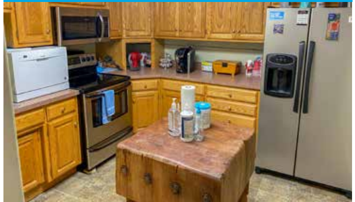
Building 1 - Kitchen