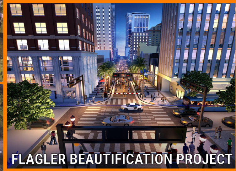
FLAGLER BEAUTIFICATION PROJECT