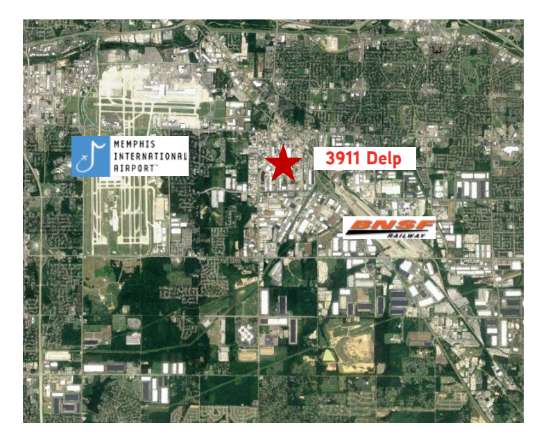
Located in the dominant Southeast submarket, east of the Memphis International Airport