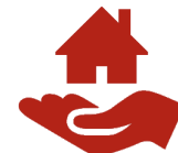
MEDIAN HOME VALUE