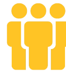
TRADE AREA POPULATION