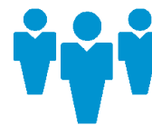
DAYTIME WORKFORCE POPULATION 16+