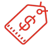
AVERAGE ANNUAL HOUSEHOLD INCOME