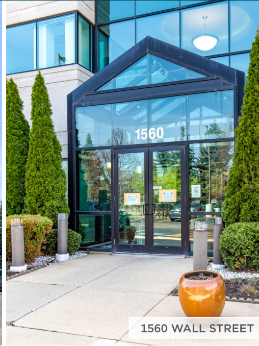
1560 WALL STREET