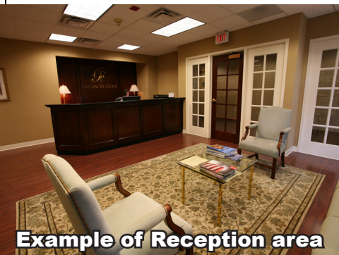
Example of Reception area