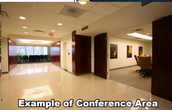
Example of Conference Area