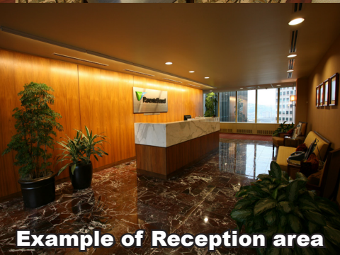
Example of Reception area