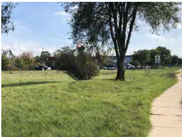
0 S Zeeb looking South toward Burger King