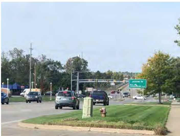
0 S Zeeb looking north towards Jackson Rd