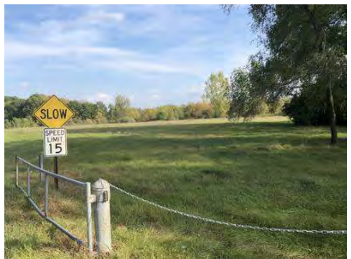
0 S Zeeb (2)