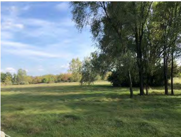
0 S Zeeb (3)