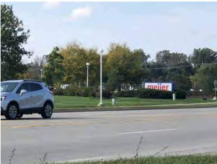
0 S Zeeb - across from Meijer