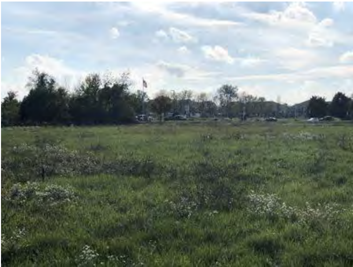
0 S Zeeb (2)