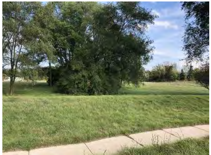
0 S Zeeb (13)