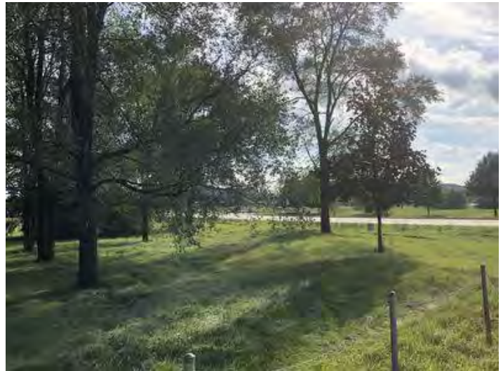
0 S Zeeb (5)