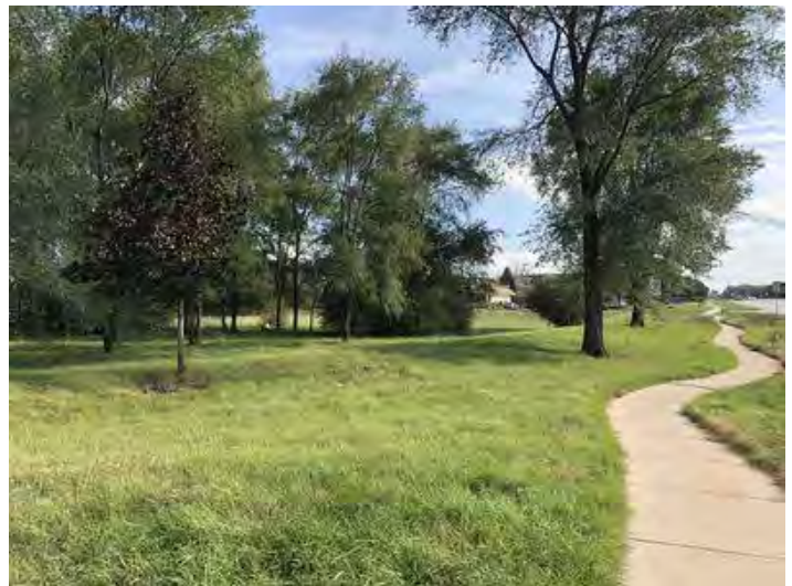
0 S Zeeb (8)