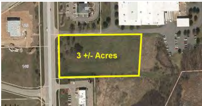
S Zeeb Aerial