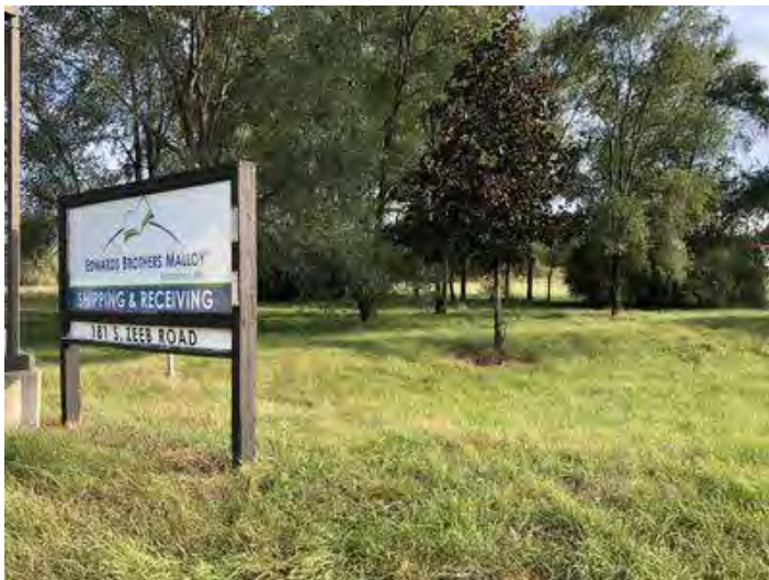
Entrance on S Zeeb