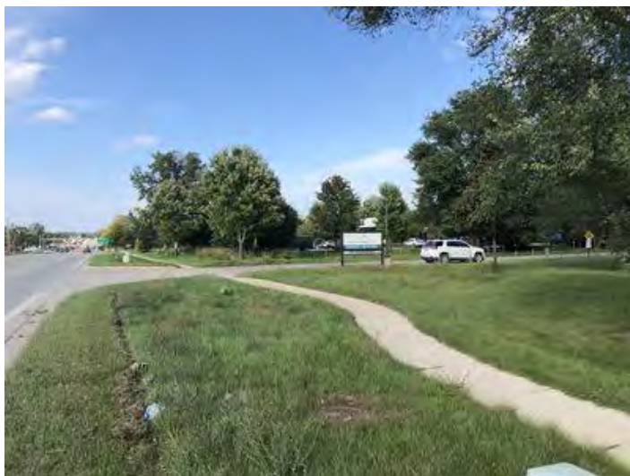
0 S Zeeb sidewalk on Zeeb Rd