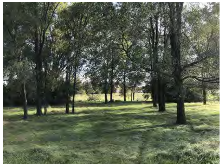
0 S Zeeb (1)