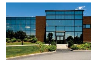
72 Cherry Hill Drive Beverly, MA

Total Building Size: 100,928 SF 100% Leased Building Type: Office/Flex