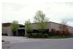
35 Cherry Hill Drive Danvers, MA

Total Building Size: 60,600 SF 100% Leased Building Type: Office/Flex