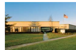
54 Cherry Hill Drive Danvers, MA

Total Building Size: 60,000 SF 100% Leased Building Type: Office/Flex