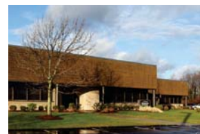
24-42 Cherry Hill Drive Danvers, MA

Total Building Size: 41,522 SF Available: 2,500-11,500 SF Building Type: Office