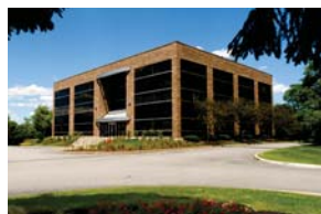
5 Cherry Hill Drive Danvers, MA

Cherry Hill Park offers easy access to Route 128/I-95 and Route 1 and is located within 20 miles from Logan International Airport. The property is adjacent to the Beverly Airport, just minutes from the North Shore Mall, local hotels, restaurants and other area amenities. Corporate neighbors include, Axcelis, Electric Insurance, Millipore, and Osram Sylvania.