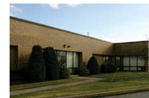
33 Cherry Hill Drive Danvers, MA

Total Building Size: 100,612 SF 100% Leased Building Type: Office/Flex