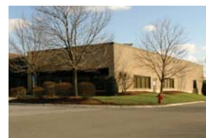
37 Cherry Hill Drive Danvers, MA

Total Building Size: 77,712 SF 100% Leased Building Type: Office/Flex