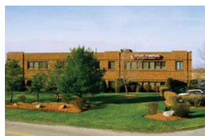
66 Cherry Hill Drive Beverly, MA

Total Building Size: 68,700 SF Available: 68,700 SF Building Type: Office/Flex