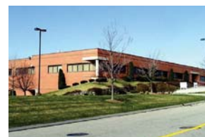
71 Cherry Hill Drive Beverly, MA

Total Building Size: 32,969 SF Available: 16,671 SF Building Type: Office