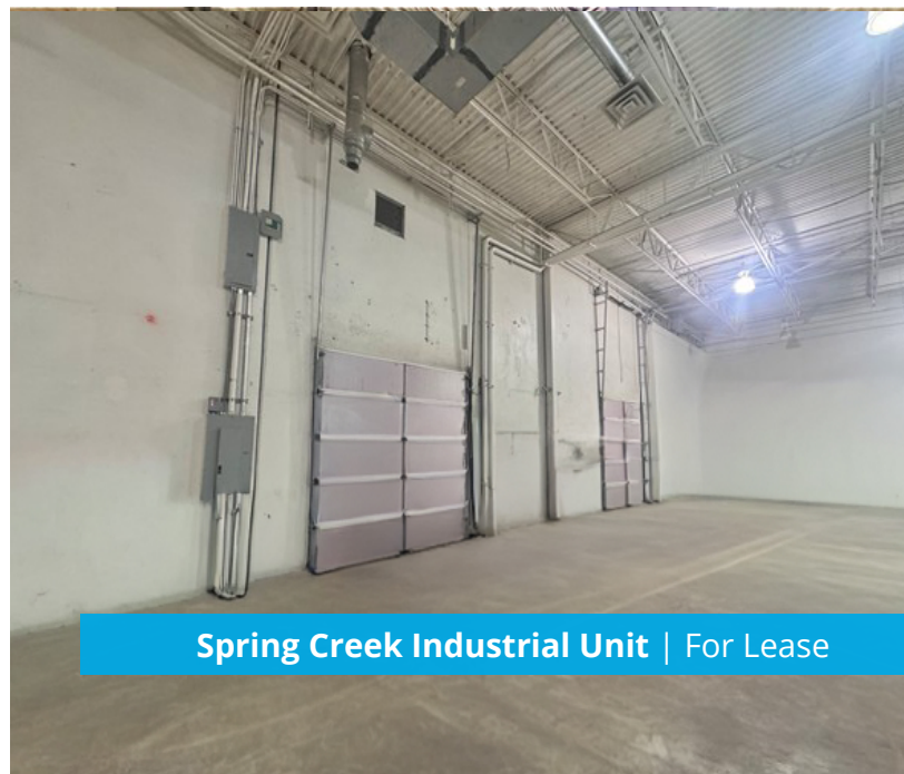
Spring Creek Industrial Unit | For Lease