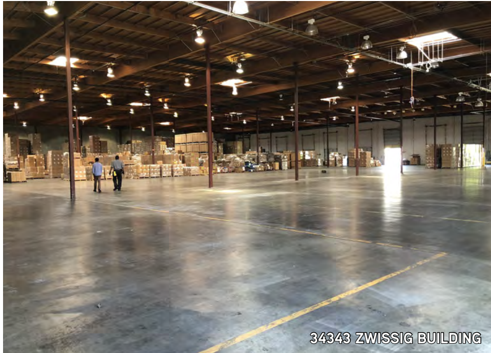
34343 ZWISSIG BUILDING