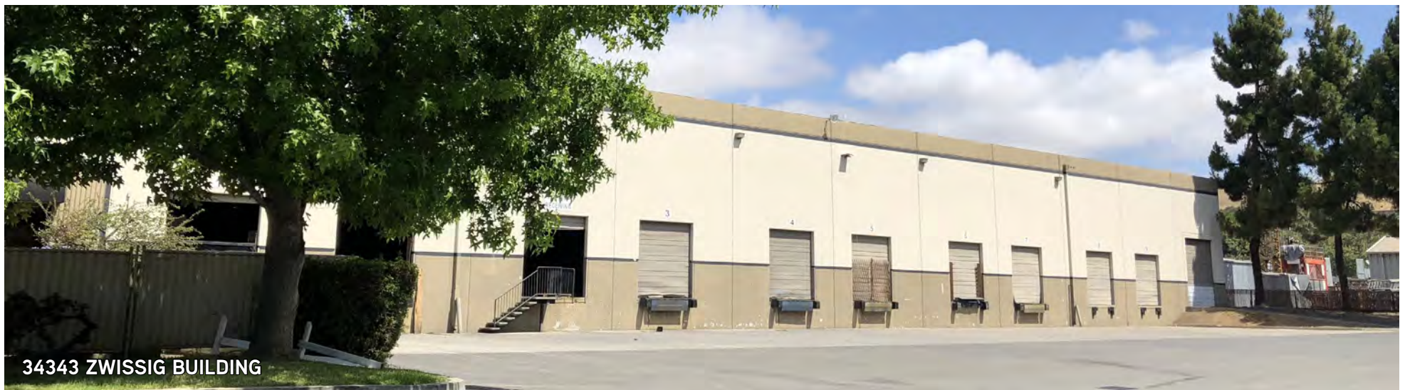
34343 ZWISSIG BUILDING