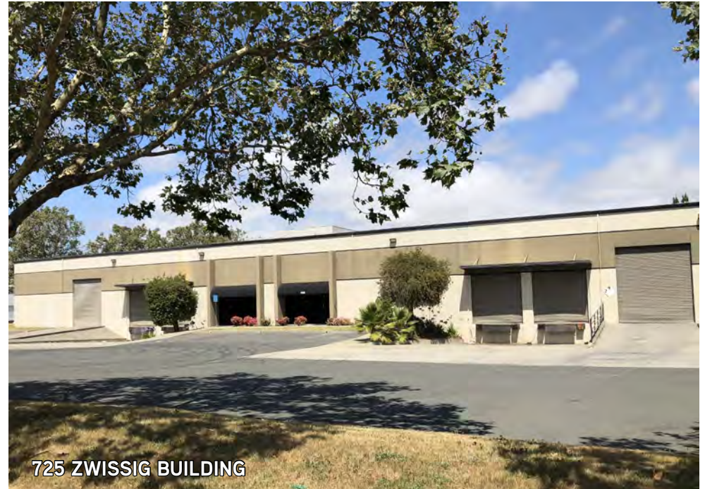
725 ZWISSIG BUILDING