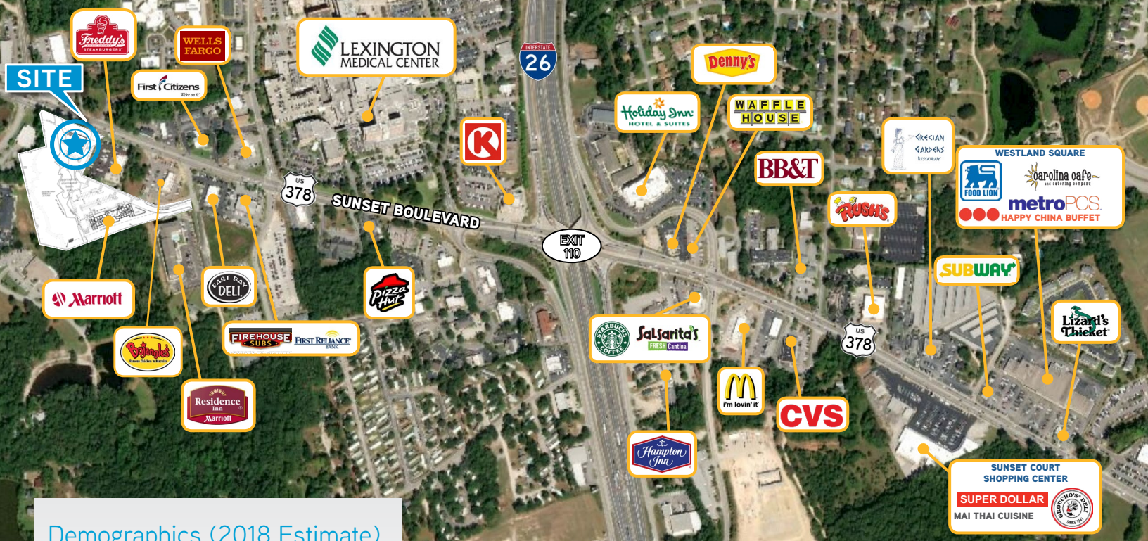
NEARBY RETAILERS AERIAL