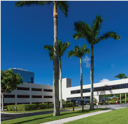
CLOCKWISE FROM TOP LEFT: Covered Walkway From Garage | Lobby Area | Exterior View of Walkway From Garage