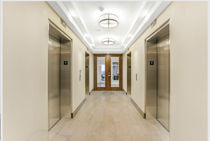
CLOCKWISE FROM TOP LEFT: New Tenant Conference Room | New Tenant Reception Area | Lobby Area | New Tenant Reception / Conference

Tower 1555 offers easy access to premium amenities, Downtown West Palm Beach and more.