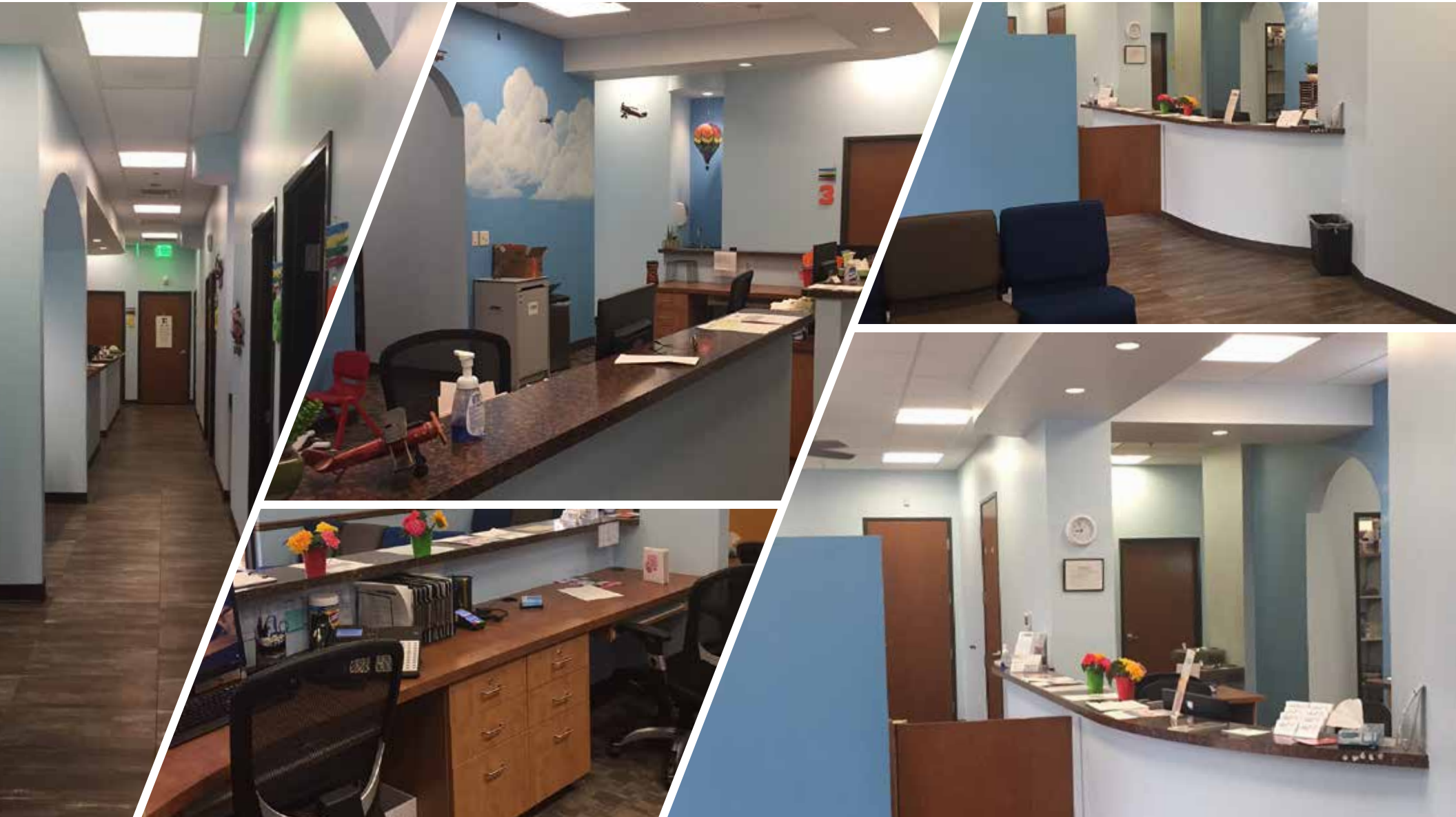
CLOCKWISE FROM TOP LEFT: Hallway to exam rooms, nurses station, waiting area, reception area.