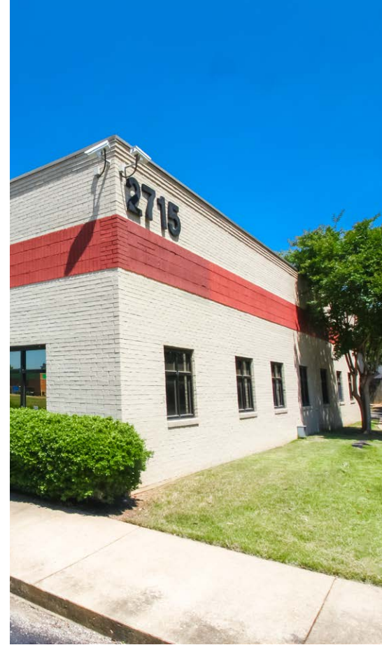
2715 Kirby Parkway | Building Plan