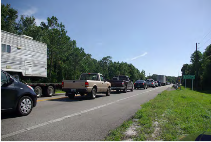
View of SR 52 Traffic westbound, west of US 41