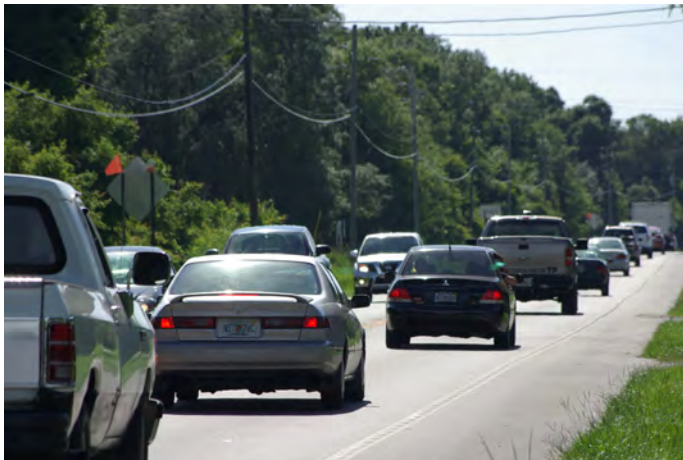
Westbound on SR 52 in front of site