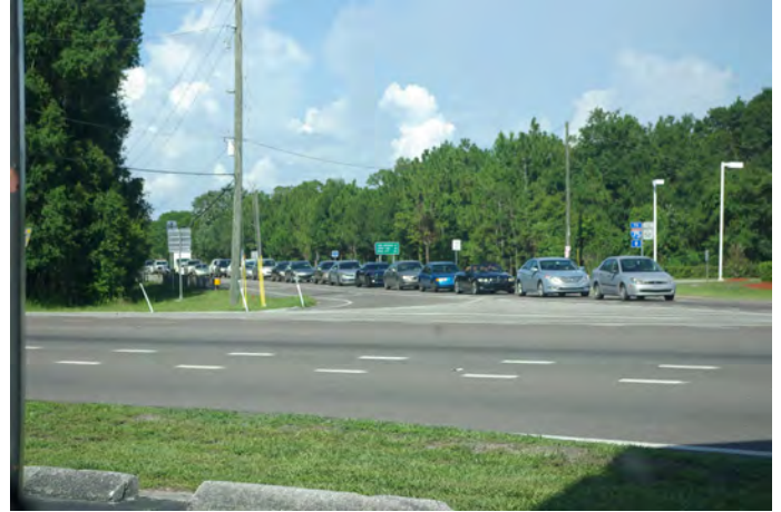
Looking East at westbound SR 52 traffic