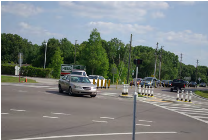
South view of northbound traffic on US 41 turning west onto SR 52