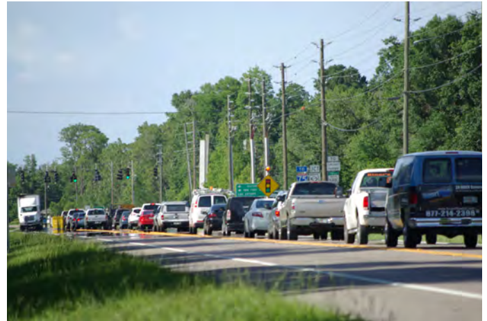
North view of northbound traffic on US 41 turning west onto SR 52