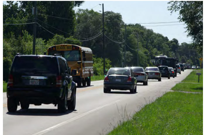
Westbound on SR 52 in front of site