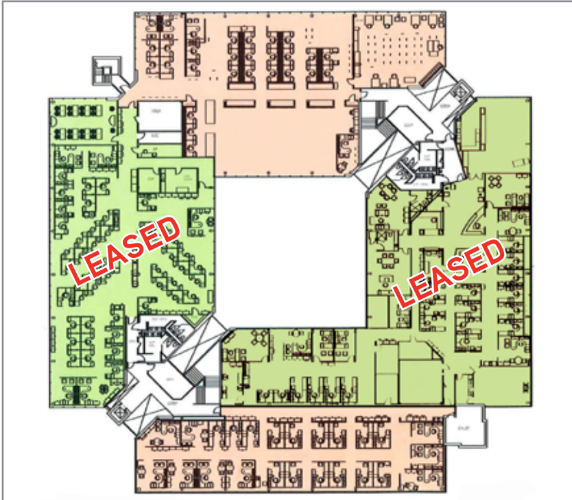
Second Floor - 14,377 SF