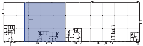
Building 208: Suite 4440 25,000 SF