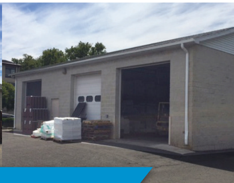
38 STACK STREET