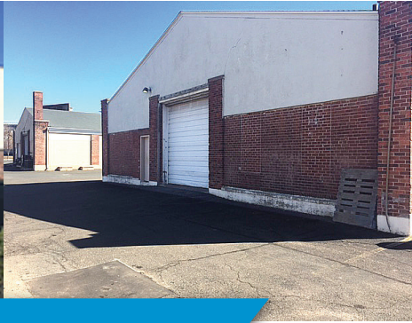
24 STACK STREET