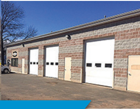
30 STACK STREET