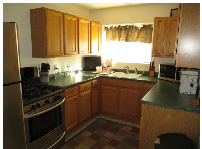
Kitchen in the attached apartment