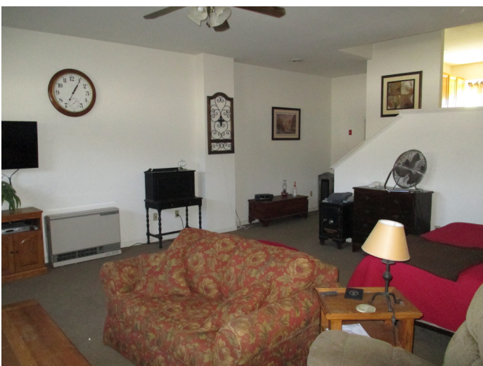
Living room in the attached apartment