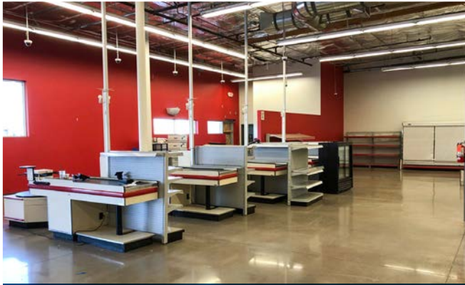
PREVIOUSLY A SAVE-A-LOT