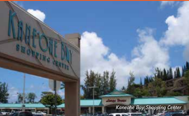
Kaneohe Bay Shopping Center

Alexander & Baldwin, Inc. is a premier Hawaii land company, with interests in real estate development, commercial real estate and agriculture. With ownership of approximately 88,000 acres in Hawaii, A&B is the State's fourth largest private landowner, and is one of the State's most active real estate investors. A&B has a diverse portfolio of real estate development projects throughout Hawaii, and a commercial property portfolio comprising eight million square feet of leasable space in Hawaii and on the U.S. Mainland. It is also the owner and operator of the Hawaiian Commercial & Sugar plantation on Maui, and a significant provider of renewable energy on the islands of Maui and Kauai. Additional information about A&B may be found at http://www.abprop.com .