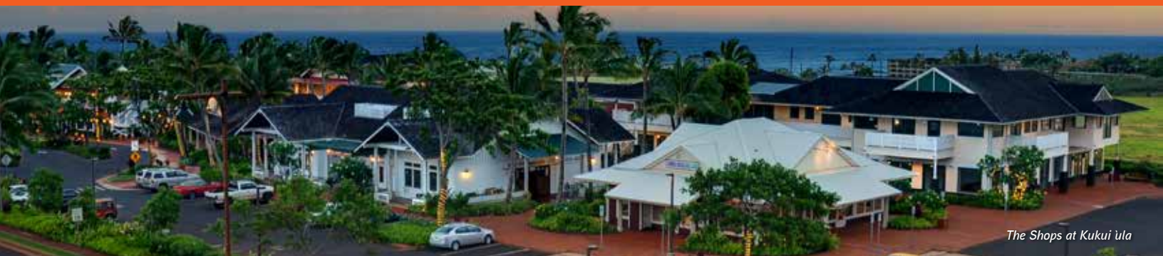
The Shops at Kukui Ula