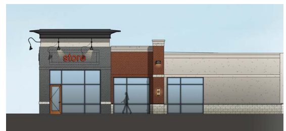
Davis Park Drive Elevation