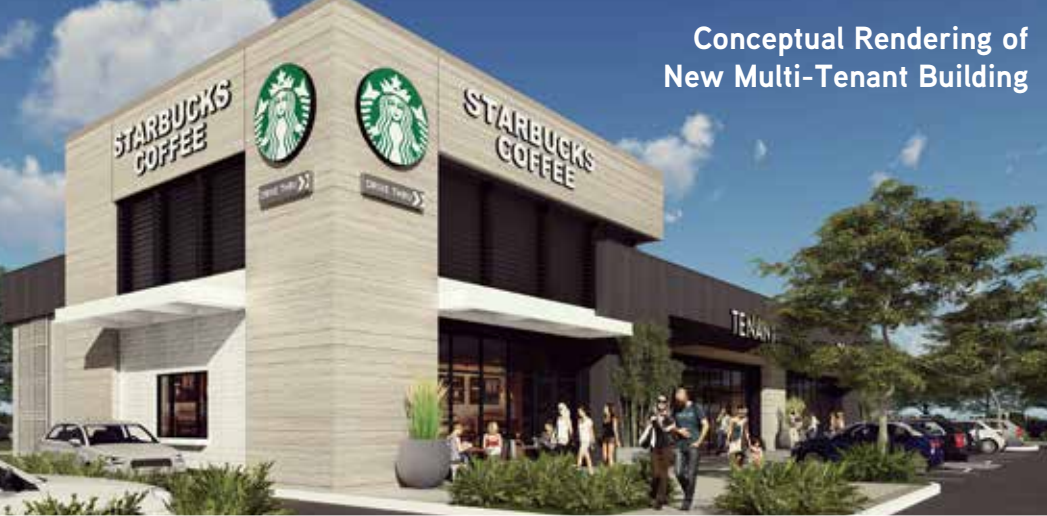
Conceptual Rendering of New Multi-Tenant Building