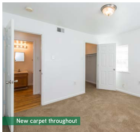
New carpet throughout