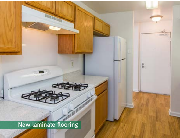
New laminate flooring