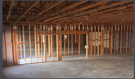
Large open floor plan with exposed ceiling

This document/email has been prepared by Colliers International for advertising and general information only. Colliers International makes no guarantees, representations or warranties of any kind, expressed or implied, regarding the information including, but not limited to, warranties of content, accuracy and reliability. Any interested party should undertake their own inquiries as to the accuracy of the information. Colliers International excludes unequivocally all inferred or implied terms, conditions and warranties arising out of this document and excludes all liability for loss and damages arising there from. This publication is the copyrighted property of Colliers International and /or its licensor(s). © 2017. All rights reserved.