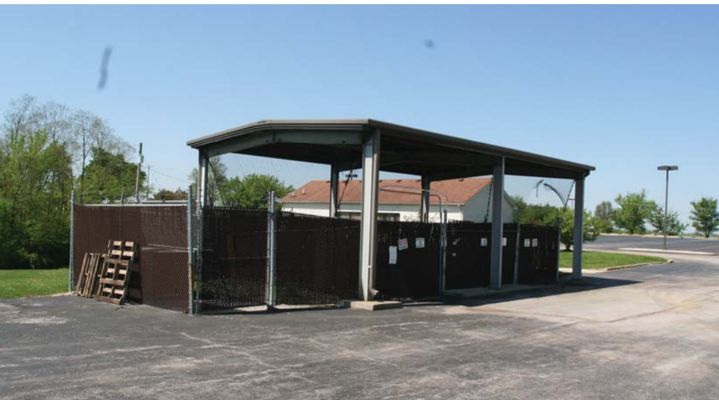
◀ Haz-Mat Storage