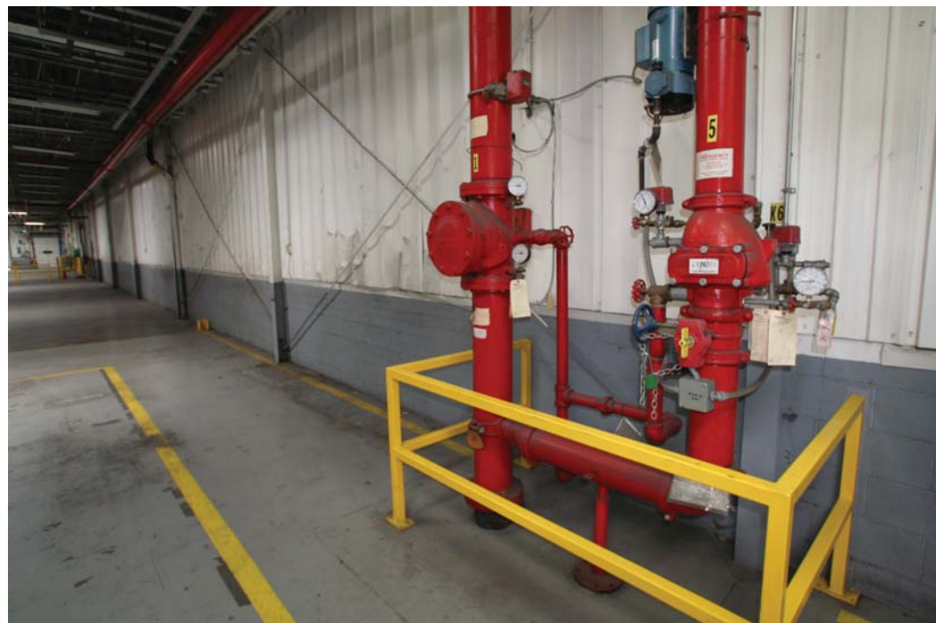
100% Sprinklered Wet & Dry System