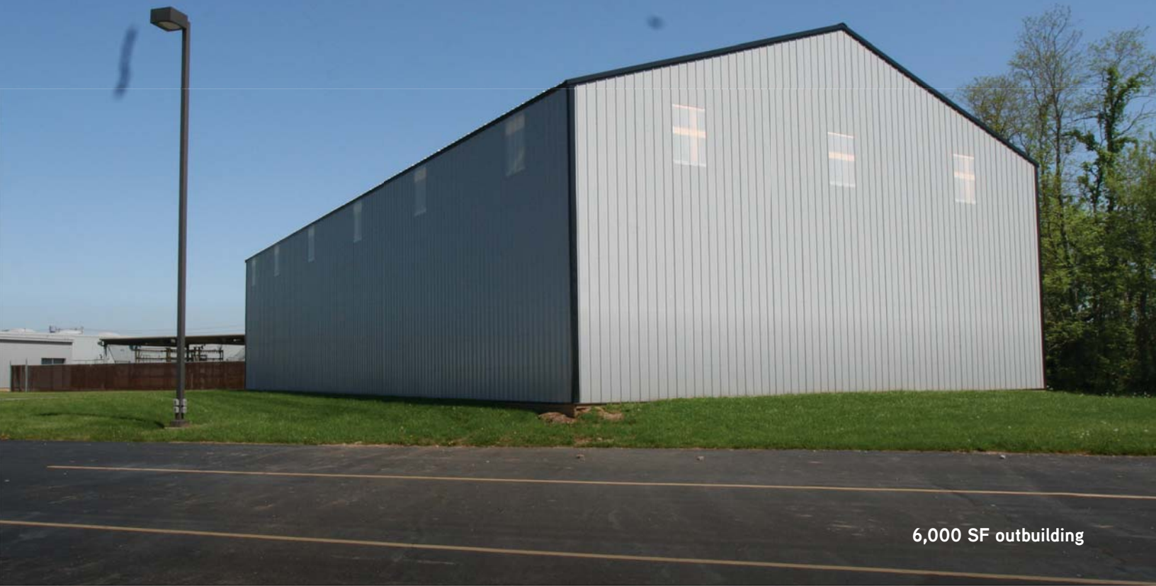
6,000 SF outbuilding