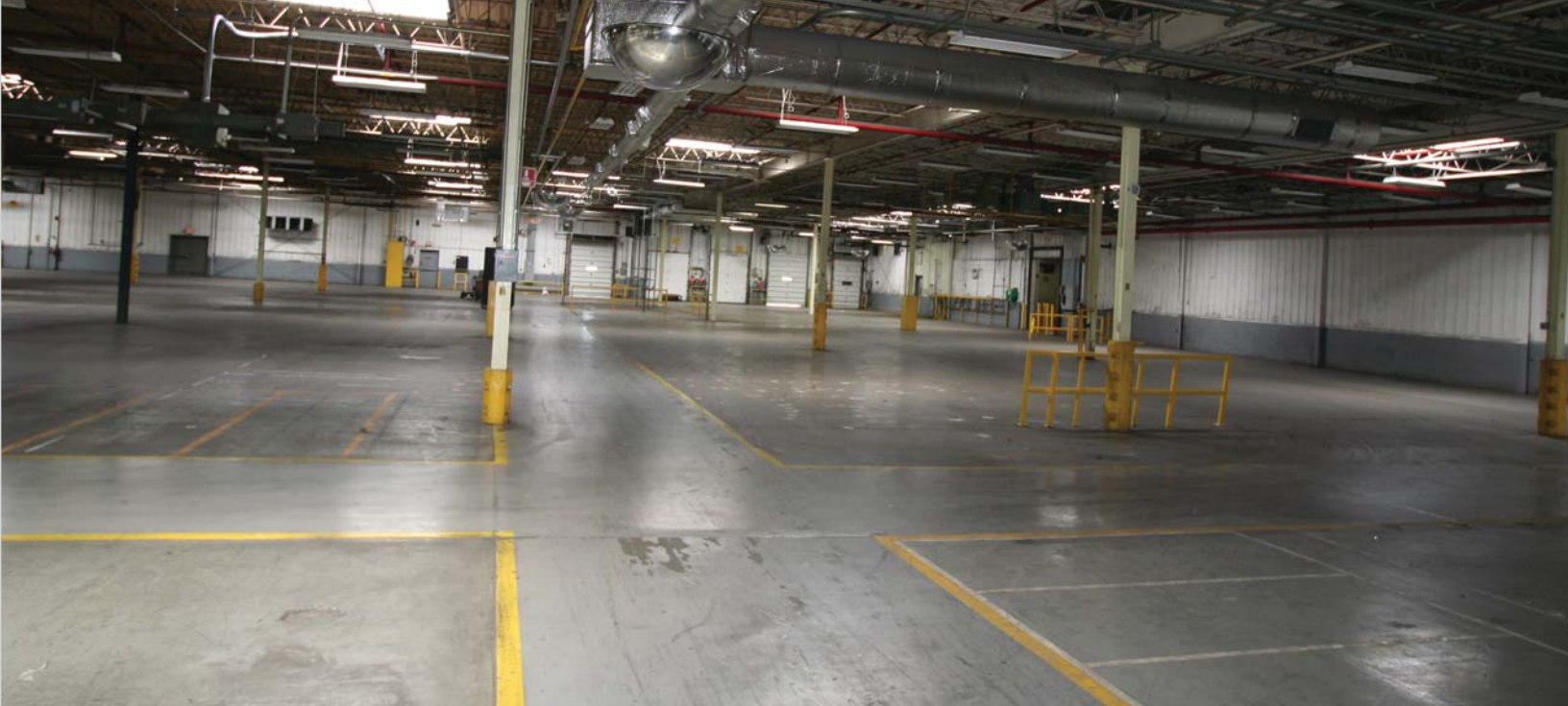
▲ Manufacturing-Warehouse- Heavy Power Distribution